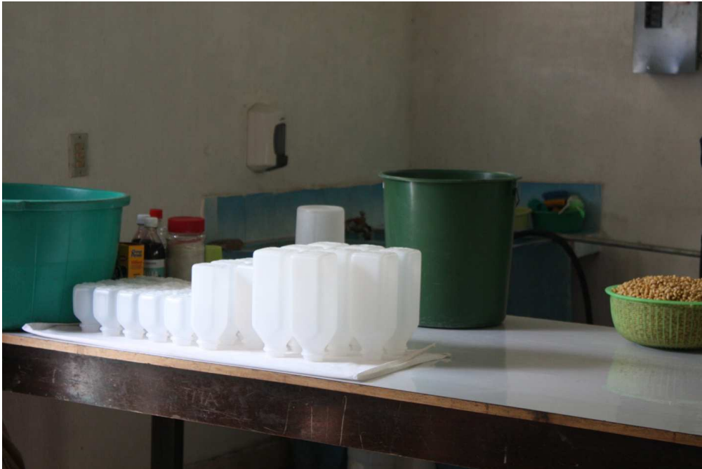
Figure 3. Plastic Containers Used for Soymilk Packaging at Centro de Artes and CECYPSA

The center has adequate space for soycow training for small to medium sized groups, and two members of their staff are trained to operate the soycow. Furthermore their culinary curriculum gives Centro de Artes the opportunity to experiment with okara and soymilk as baking ingredients. Foods currently produced include cakes, tortillas, and breads. Because of their existing curriculums, the development of a soycow training and product development curriculums or workshops is a natural fit for Centro de Artes.