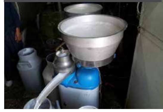
Milk/cream separation at Hiruth's processing plant.

The other challenge was to overcome the consumption fluctuation. The USAID project also provided technological support for processing milk into dairy products thus enhancing both the value and shelf life. Additionally, project support enabled the production of pasteurized milk into wide varieties of cheeses and other dairy products.