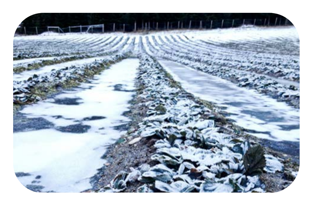
Exhibit 12. Winter picture of strawberry plants 2013

Note. Income, costs and profits are associated with management accounts exempting the financial results.