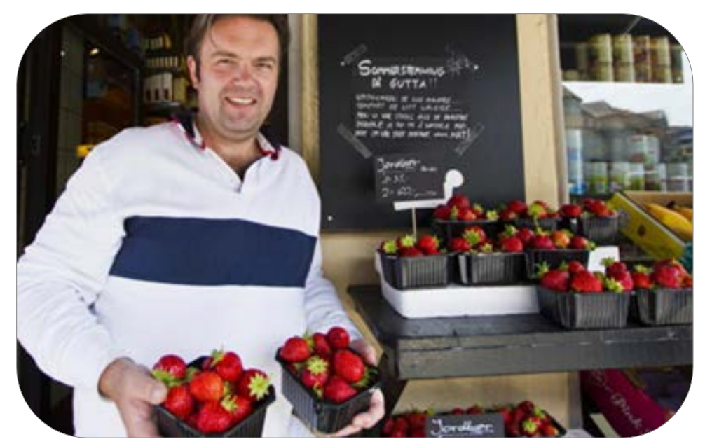
Exhibit 7. Norwegian strawberry retail business