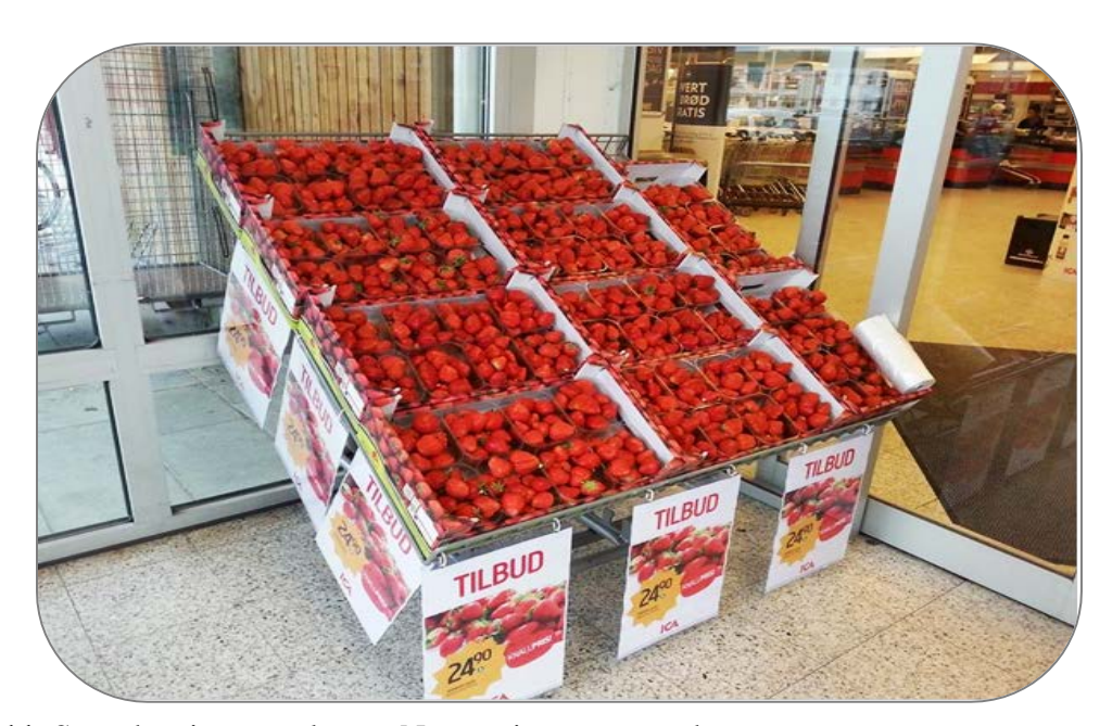
Exhibit 11. Strawberries on sale at a Norwegian supermarket