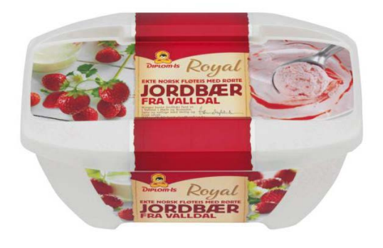
Exhibit 3. Valldal branded frozen strawberries and ice cream branded ingredients from "Valldal"