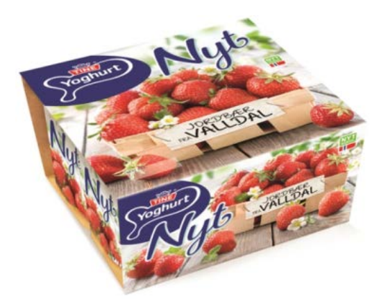
Exhibit 4. The Valldal Tine yoghurt

up market HoReCa businesses and selected delicatessen stores. In 2014, Valldal Grønt signed an agreement with Tine, the dominant dairy product producer in Norway with a 90% market share, to distribute yoghurt products bearing the Valldal brand.