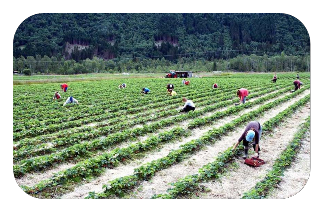
Exhibit 9. Picking strawberries in Valldal

A range of factors impact harvest quality and quantity. Colder weather slows plant growth. The age of the plants also affects strawberry yields. Rain deteriorates product quality, and when rain is a factor, daily harvests of strawberries for fresh consumption have been reduced by as much as 80% for the entire studied region. When rain is a factor, pickers are then directed to harvest them for industrial use. Strawberries designated for industrial use are a lower quality. Other major threats to strawberry production include soil deterioration and insect attacks. Growing strawberries in the same fields year-after-year eventually depletes soil quality. In order to replenish the soil, fields are rotated and used to grow grass for animal feed or other soiling enhancing crops such as potatoes. In the studied valley, specialization which becomes too focused on strawberry production becomes a threat. Insects attacking strawberry plants are another threat that has reduced harvests up to 80% in certain strawberry fields. This risk has been controlled through precautionary measures which includes the use of pesticides.