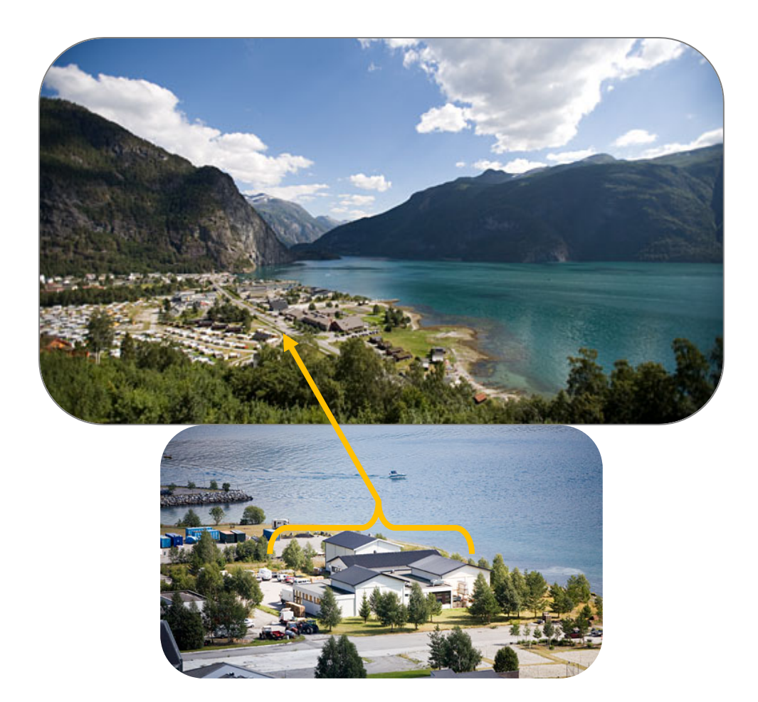
Exhibit 6 . The upper picture shows the village of Valldal in the fjord region on the west coast of Norway. The Lower picture shows a close-up of the Valldal Grønt production and warehouse facility.